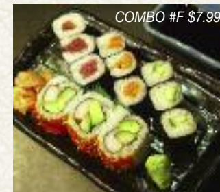
COMBO #F $7.99