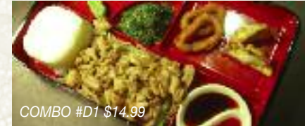
COMBO #D1 $14.99