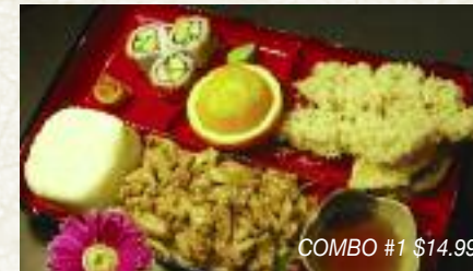
COMBO #1 $14.99